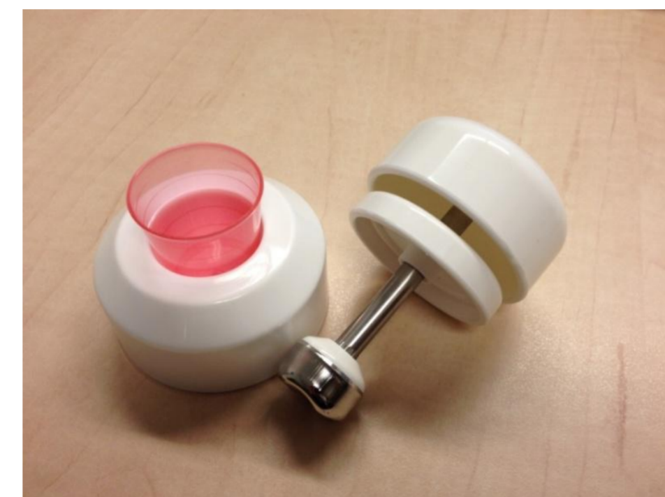
Figure 1: Tablet crusher